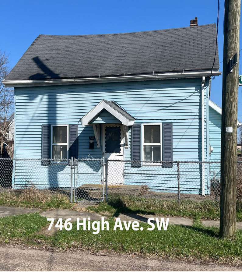
OPEN HOUSE: TUESDAY, APRIL 29, 2025 12:00-1:00 PM